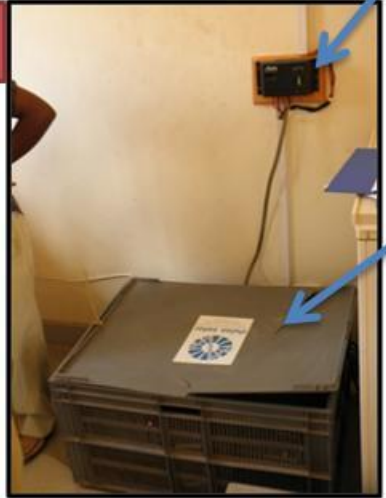
Bat. Pack cased