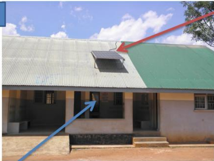
Roof-top Solar Panel (120 Watt x 4; serial connection)